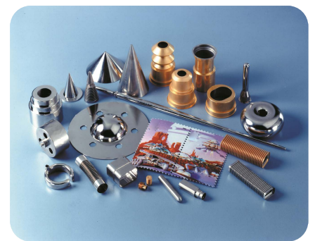
Servometer® electroformed a rigid, low-mass blood analyzer probe (center) with a 0.023 in. orifice at about a third the cost of precision machining and manual finishing. The probe has walls just 0.008 in. thick.

Thin walls and ductile nickel give electroformed bellows just one-fifth to