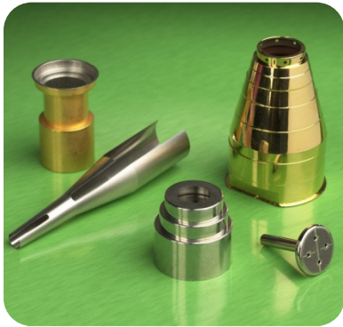
Electroforms are available in a variety of shapes, sizes, thicknesses and materials.

A leading manufacturer of diagnostic imaging equipment sought to reduce the size of its solid state camera probe, but faced a complex manufacturing challenge. The miniaturized camera retainer at the tip of the probe had to be made to precise tolerances to keep the device properly aimed and focused.